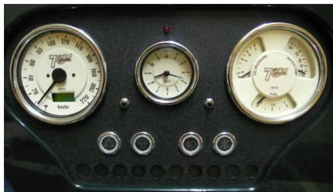
To the right is photo of the new switches on an earlier 2002 car (Le Mans 62)

After a trip around the Morgan Factory last year I saw some of the newer switches that are used on Aeros and traditional cars (post 2008) and the main body of the switch appeared to look the same as they are indeed made by the same company 'EAO' ( www.eao.com ) a German company. I was aware that 'Simmonds' had tried to source these without any luck as they were 'customised' for Morgan and so felt that these were never to be available.