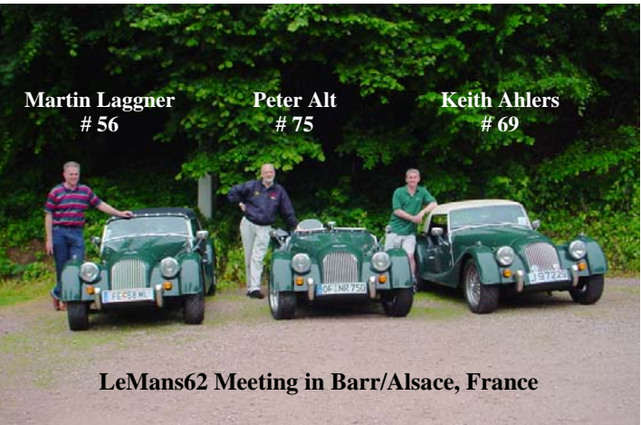
LeMans62 Meeting in Barr/Alsace, France