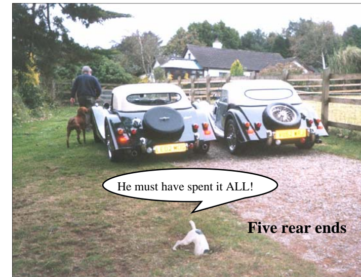
Five rear ends