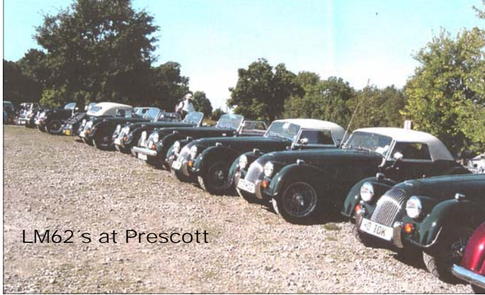
LM62's at Prescott