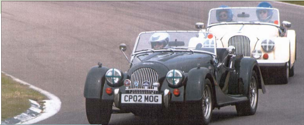
No. 9 - Track Day at Goodwood