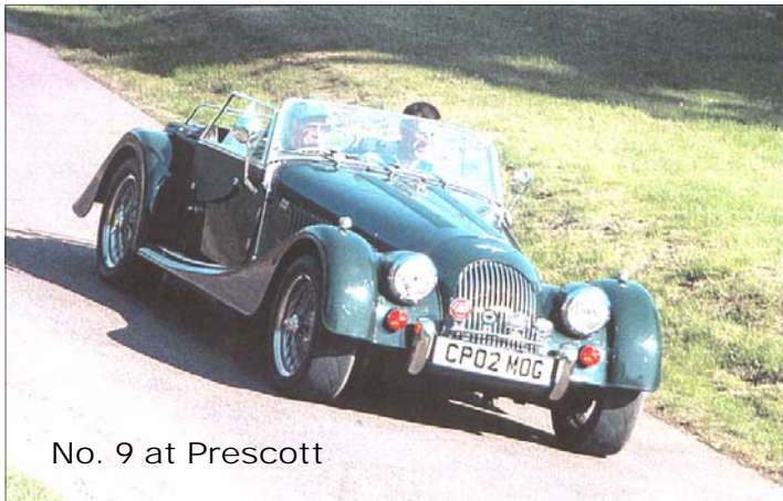
No. 9 at Prescott

By the way - I'm organizing the Morgan Club Deutschland Spring Meeting May 28.-31. 2004. To have a couple of LM62s, wouldn't be bad. You'll get an invitation with the first News Bulletin 2004.