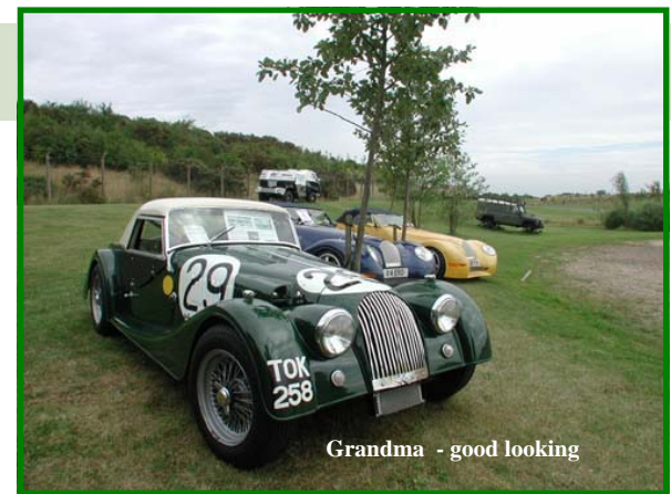
Grandma - good looking