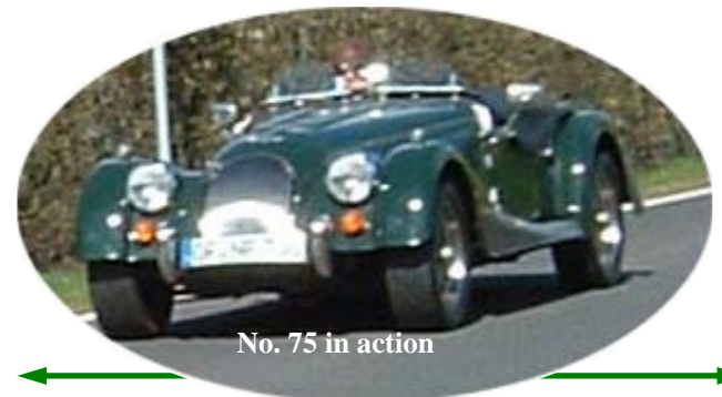
No. 75 in action