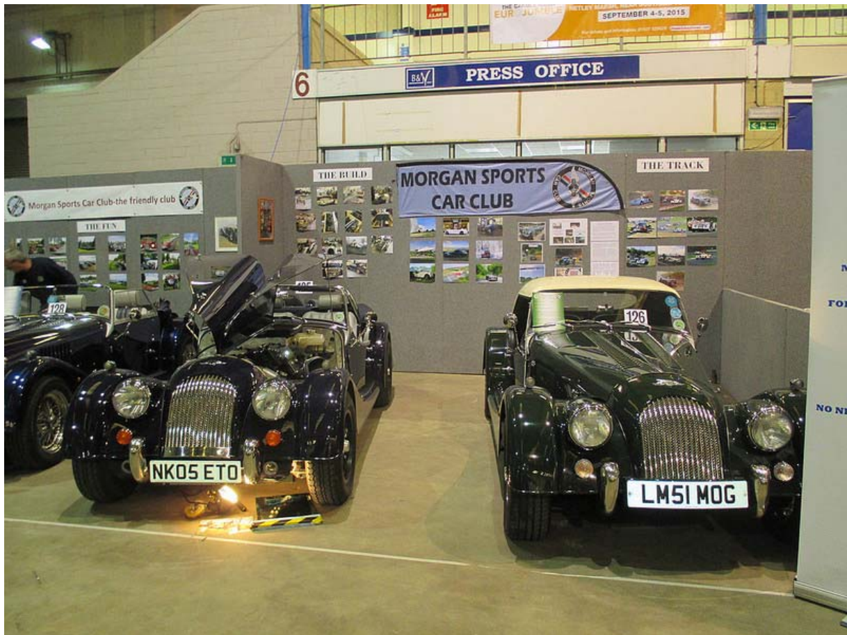
Car 18 "all Bristol fashion" at the Bristol Classic Car Show