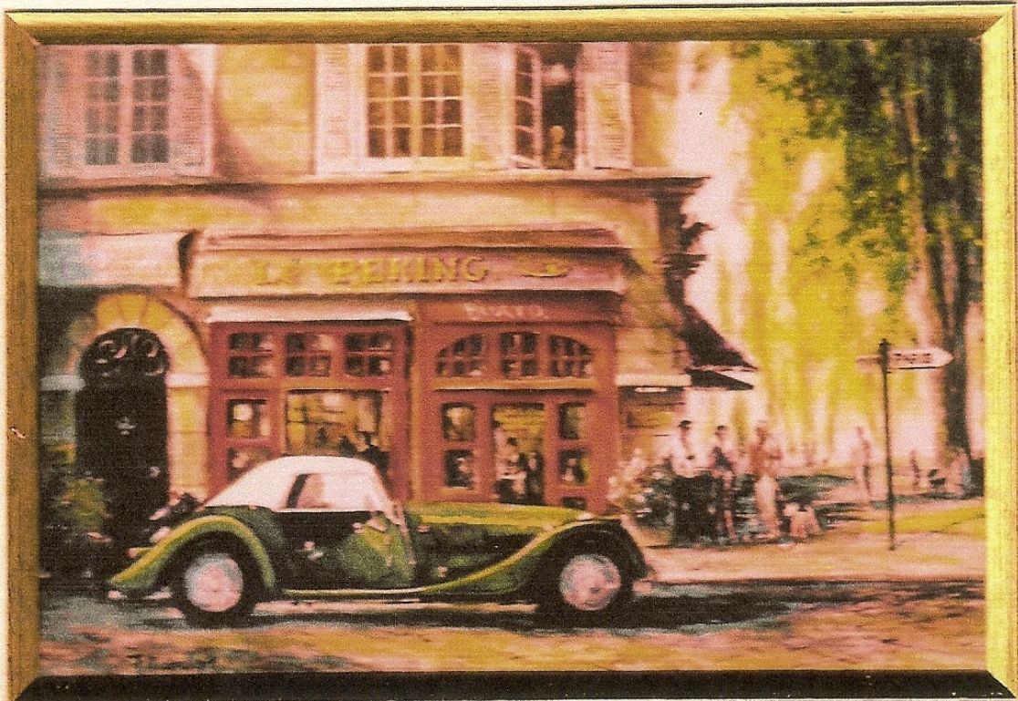
"Peking to Paris"