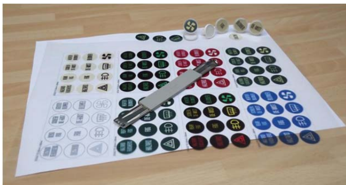
Hardest part is cutting out the new tops

A printable PDF file is available to download from the Le Mans 62 Website under 'Tips' and look for 'Modified Switches'