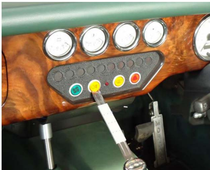
Removing the existing lenses is very simple

You will need four lenses and the tool to remove lenses”