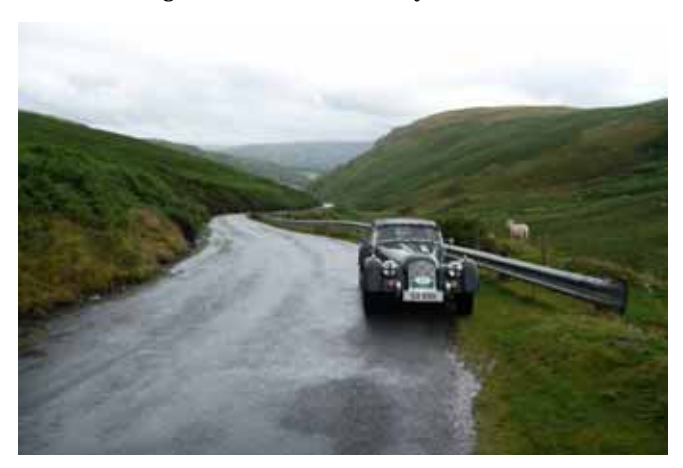
Those glorious sunny July days!

When we decided to attend the Centenary Weekend we decided that we would be displaying the car (with other LM62ers) with the hard top on. But being held at the end of July we should plan to spend the majority of the week with the top definitely off. (If only we knew what the weather would really be like!) With this in mind we set about locating accommodation that would allow us to store the top whilst not being used. This we achieved and led to us ironically driving most of the week with the soft top attached during the evenings and using the Storm Cover during the night to ensure the cockpit remains dry. This was probably the longest we had driven the car with soft top and the diversion to visit a friend during the week in Aberystwyth, via the mountain road with the inevitable poorer weather allowed us to discover the fact that the soft top leaks at the seams, right down the back of your neck!