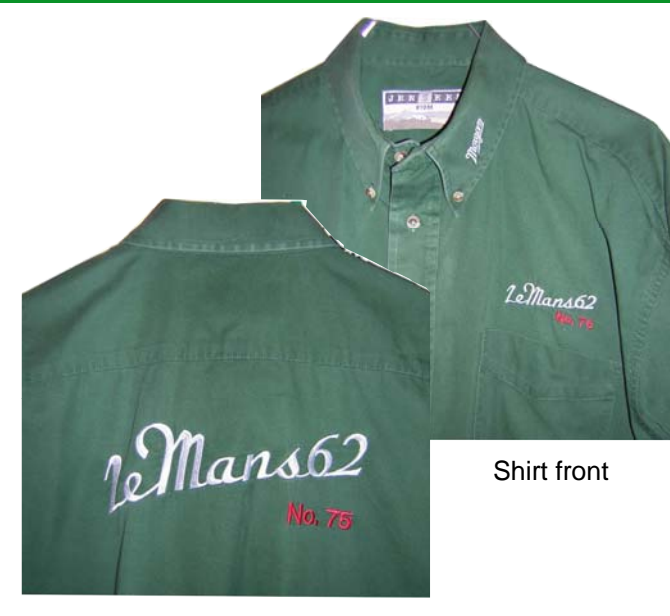
Shirt back - option